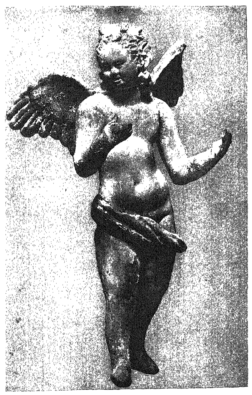
2. Winged Eros